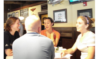
Young Alumni events include community service, Happy Hours, sporting events.

I am trying to gauge interest in having an event at the Williamsville Winery. The event would involve wine tasting, a tour of the winery and lunch. The price for the lunch, tour and wine tasting is $30. If we have a fair amount of interest, we can also look into getting a chartered bus to take us from the Norfolk area to the winery and back. Please let me know by July 12 , if